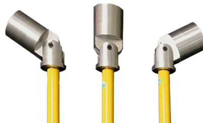
With stands Temperatures of up to 356°F (180g)