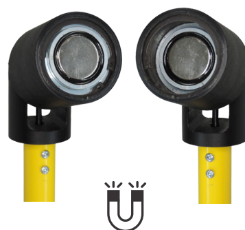
Magnet with 88 Pound Force