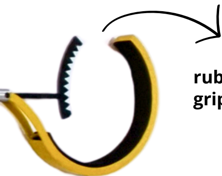
rubberized tip for better grip on the tube